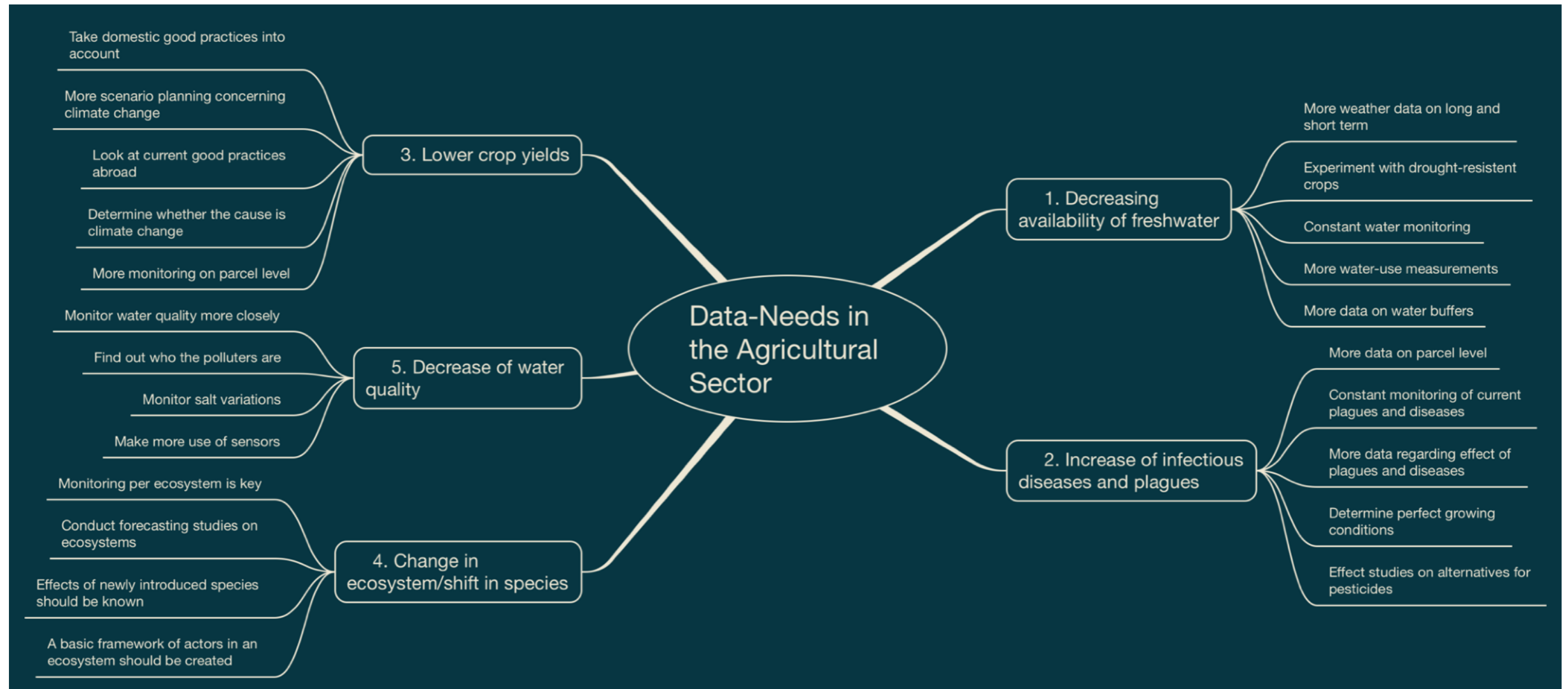
Figure 5. Mind-map of particular data-needs