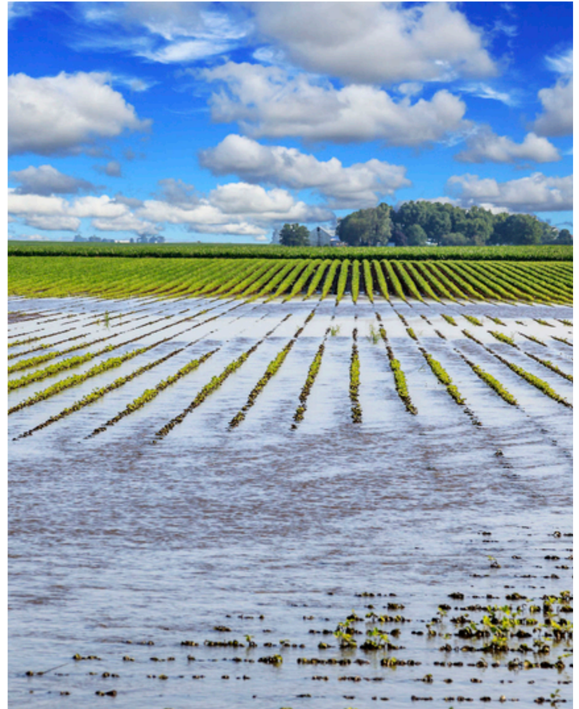
Figure 4. Water damage on crops.