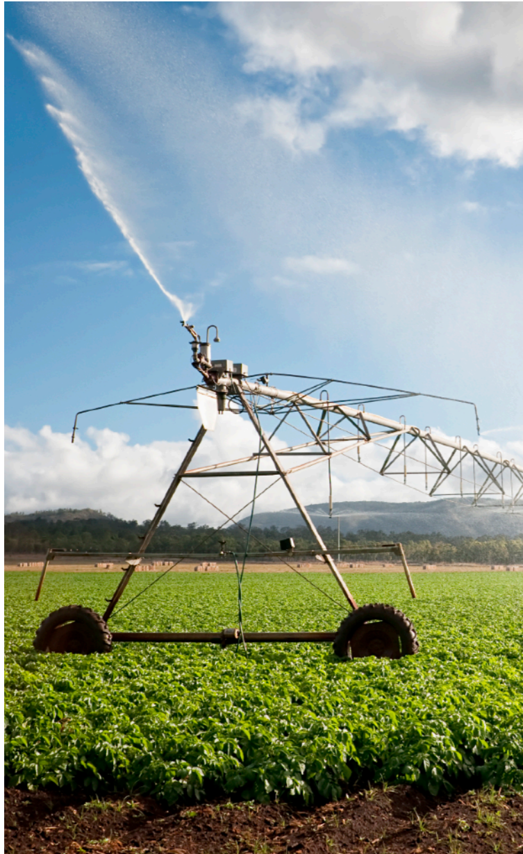
Figure 3. Crop irrigation.