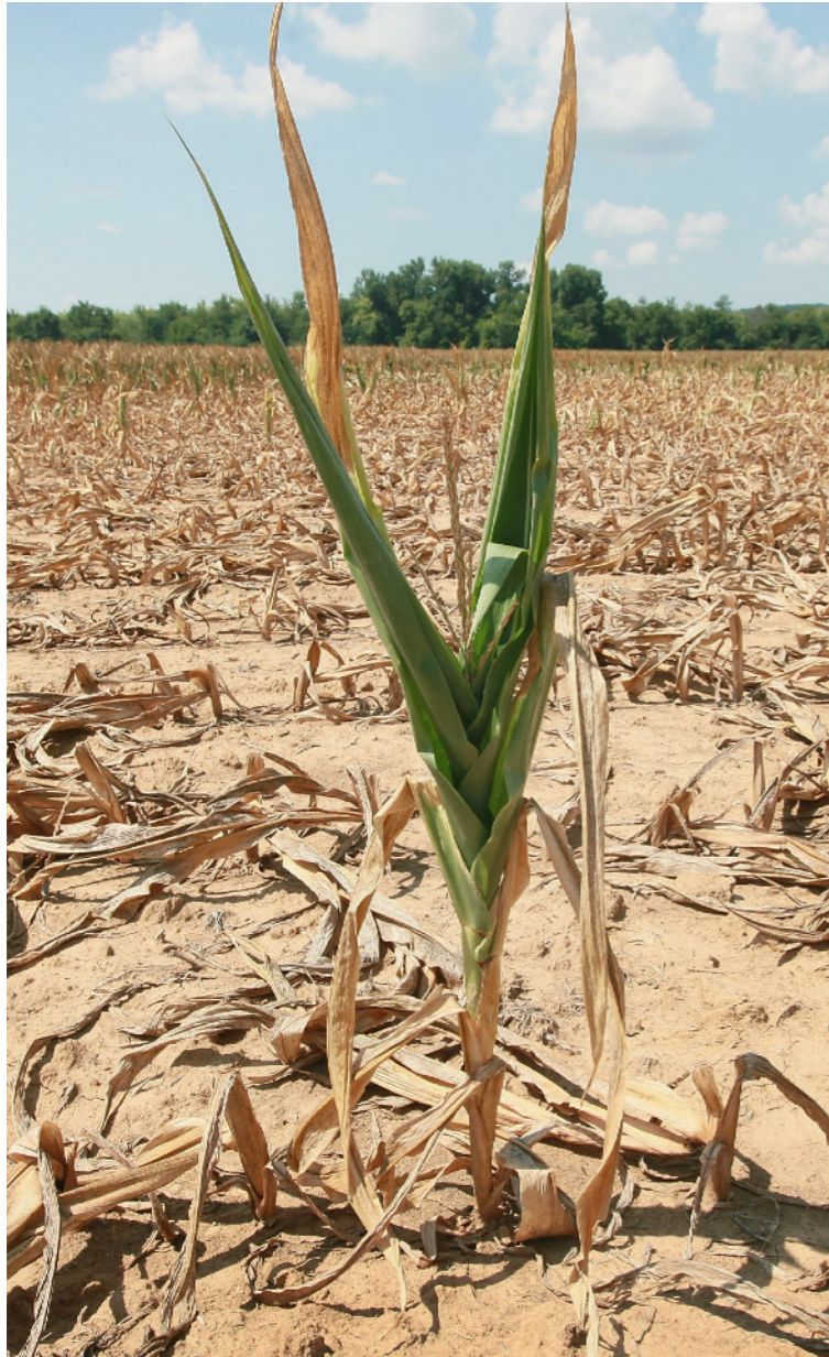
Figure 1. Drought damage on crops.

The climate in the Netherlands is currently changing. The average temperature is increasing, and the sea level is rising. This has numerous consequences for all kinds of sectors. In order to prevent damage and big disasters from happening, it is important to adapt to these changing circumstances. Before implementing all kinds of climate change adaptations, proper research should be conducted (Howden, 2007; Nelson et al., 2009). In order to know what kind of research we should conduct, a set of data-needs should be determined. As these climate change effects and data-needs could be region-specific, we chose, together with Statistics Netherlands (CBS) and the municipality of Zwolle, to conduct this research on the regional scale, namely the region of Zwolle.